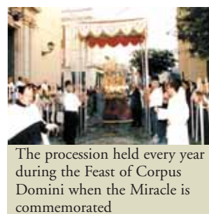
The procession held every year during the Feast of Corpus Domini when the Miracle is commemorated