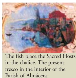
The fish place the Sacred Hosts in the chalice. The present fresco in the interior of the Parish of Almácer