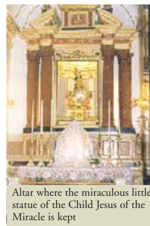
Altar where the miraculous little statue of the Child Jesus of the Miracle is kept