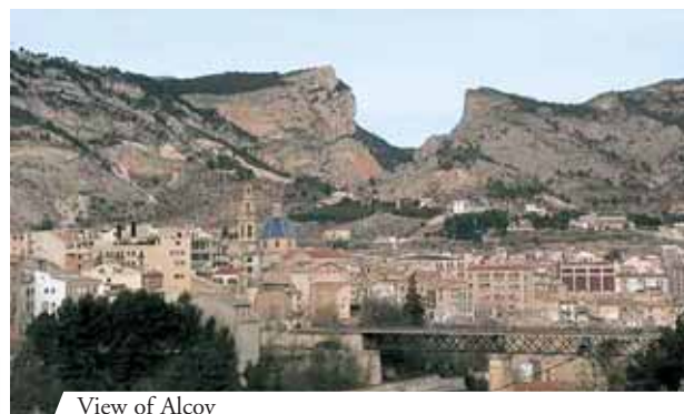
View of Alcoy