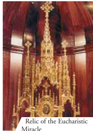
Relic of the Eucharistic Miracle

The Eucharistic miracle that took place in Alcoy in the year 1568 regards the miraculous retrieval of some consecrated Hosts that had been stolen. The miracle is still remembered every year by the habitants of Alcoy in a festival that is celebrated on the feast of Corpus Christi. The house of the man who committed the sacrilege was turned into an oratory and can be visited to this day.