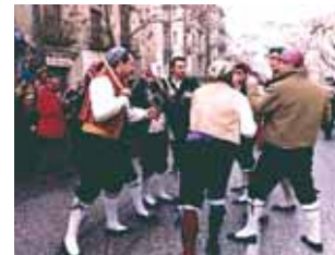
Dance of the Paloteig that takes place during the procession of the Jesuset of the Miracle