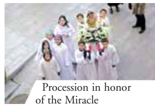
Procession in honor of the Miracle