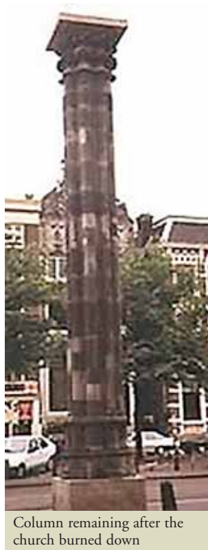
Column remaining after the church burned down