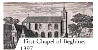
First Chapel of Beghine, 1397