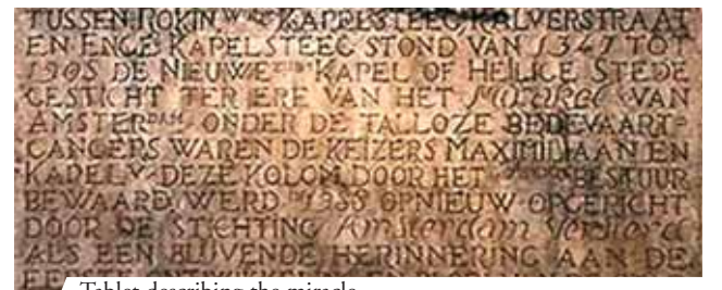
Tablet describing the miracle