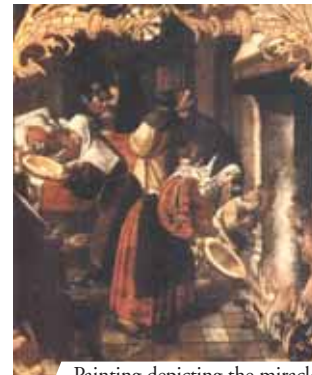
Painting depicting the miracle