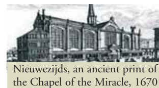
Nieuwezijds, an ancient print of the Chapel of the Miracle, 1670