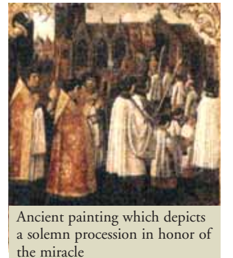
Ancient painting which depicts a solemn procession in honor of the miracle