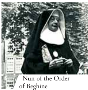
Nun of the Order of Beghine