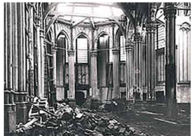
The chapel of the church was destroyed again in 1908