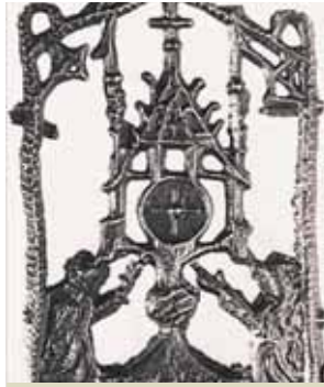
Sculpture of the ancient monstrance which contained the miraculous Host