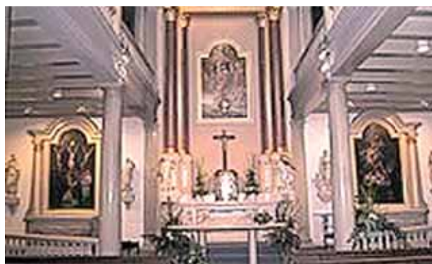
Chapel of the Blessed Sacrament