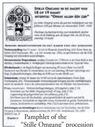
Pamphlet of the "Stille Omgang" procession