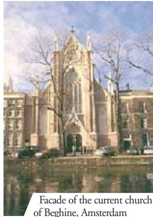
Facade of the current church of Beghine, Amsterdam

In 1452 the chapel was destroyed by a fire, but strangely the monstrance containing the miraculous Host remained intact.