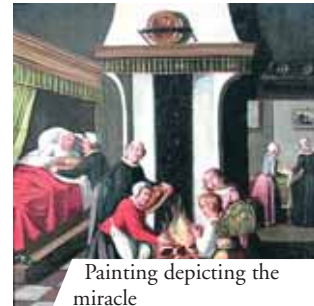
Painting depicting the miracle