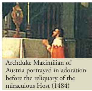
Archduke Maximilian of Austria portrayed in adoration before the reliquary of the miraculous Host (1484)