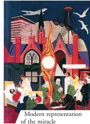
Modern representation of the miracle