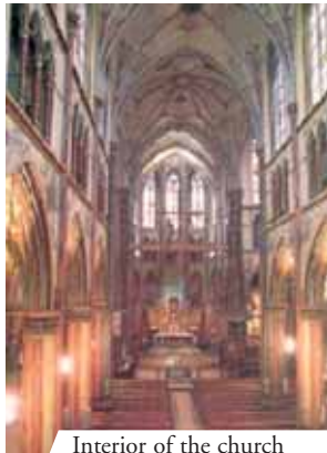
Interior of the church