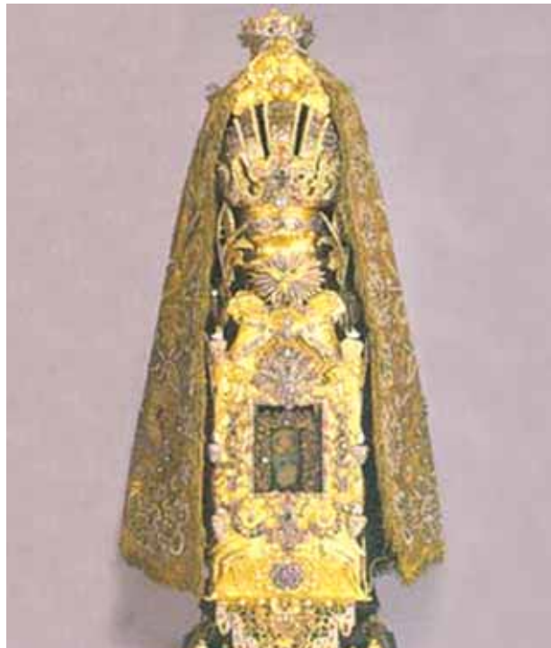
Reliquary containing the Host of the miracle known as Wunderbarlichen Gutes

The Eucharistic Miracle of Augsburg, is known locally as Wunderbarlichen Gutes – “The Miraculous Good”. It is described in numerous books and historical documents that can be consulted in the civic state library of Augsburg. A stolen Host was transformed into bleeding flesh. In the course of the centuries, several analyses were completed of the Holy Piece that have always confirmed that human flesh and blood are present. Today the Convent of the Heileg Kreuz (Holy Cross) is taken care of by the Dominican Fathers.