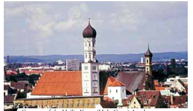
Convent of the Heilig Kreuz (Holy Cross) Augsburg