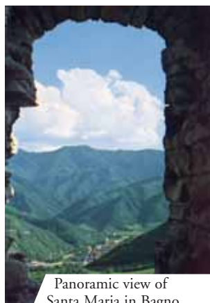
Panoramic view of Santa Maria in Bagno