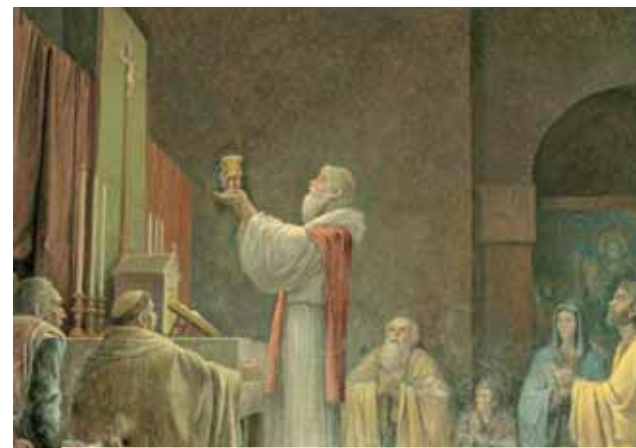
Picture that depicts the miracle present in the basilica