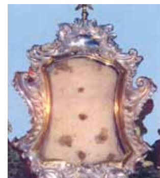
Relic of the Blood-stained corporal