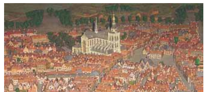
A model of the city of Bergen at the time of the miracle