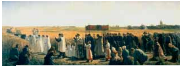
Jules Breton, Procession of the Blessed Sacrament , 1857

The city of Bergen is famous not only for its characteristic canals but also for a Eucharistic miracle that took place there in 1421. For many months, the pastor of the Church of Saints Peter and Paul had experienced doubt about whether the Body and the Blood of Christ was truly present in the consecrated Host. The priest showed no devotion towards the Blessed Sacrament, so much so that one day after celebrating Mass he took the remaining consecrated Hosts and threw them in the river. Some months later the Hosts were found again floating in the water and stained with blood.