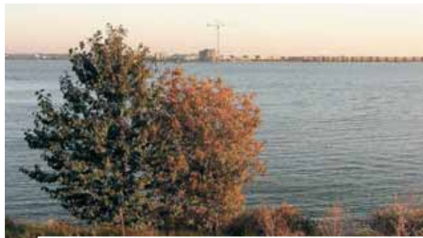
View of the Schelda River