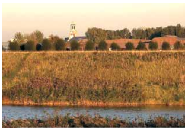
The church of Saints Peter and Paul and the River Schelda