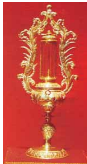
Reliquary of a Thorn from the Crown of Jesus