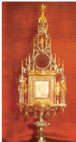
Reliquary of the Eucharistic miracle, corporal stained with blood