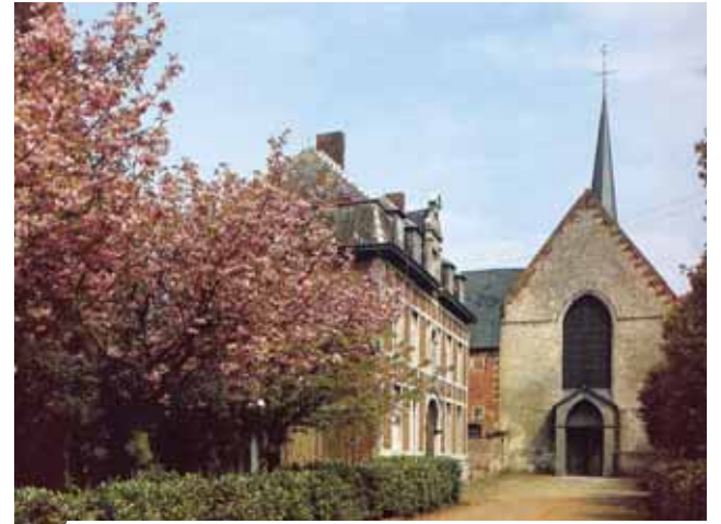
Premonstratensian Abbey, Chapel of the Holy Blood