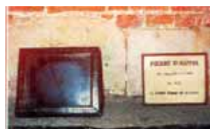
Picture of the altar where the curé of Haut-Ittre celebrated the Holy Mass where the miracle was verified