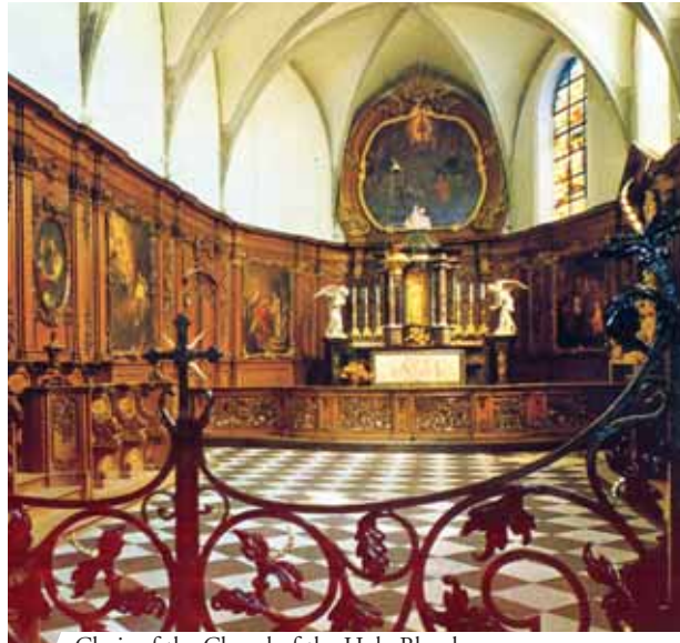
Choir of the Chapel of the Holy Blood

On January 13th, 1424, Pope Martin V approved the building of the Monastery of Bois-Seigneur-Isaac. Today the monastery is the goal of pilgrimages. The corporal stained with blood is exposed to view in the chapel.