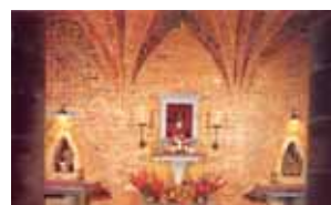
Sanctuary of the Holy Blood, Reliquary Chapel