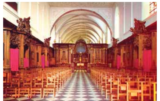
Interior of the Chapel of the Holy Blood