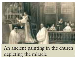
An ancient painting in the church depicting the miracle