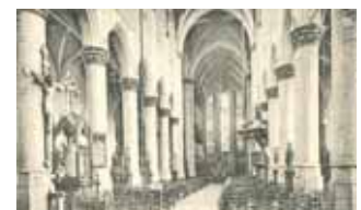
Interno della chiesa