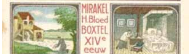
The Eucharistic miracle took place at St. Peter's Church in Boxtel