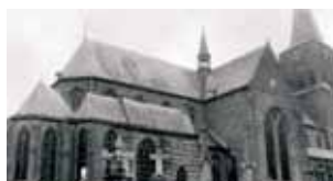
Il Miracolo Eucaristico si verificò nella chiesa di San Pietro a Boxtel