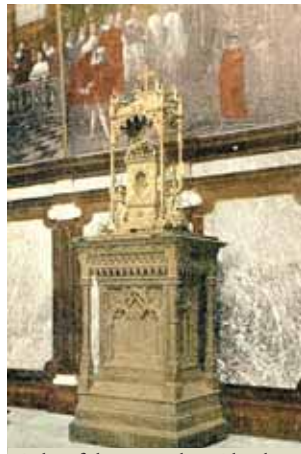
Relic of the miraculous Blood, St. Catherine's Church