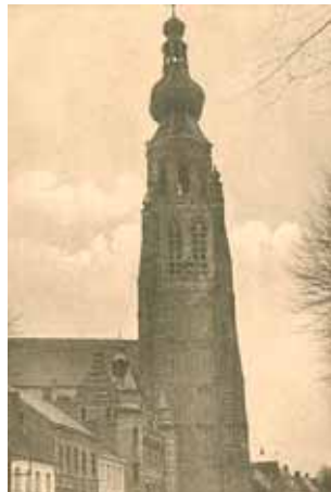
Exterior of St. Catherine's Church, Hoogstraten