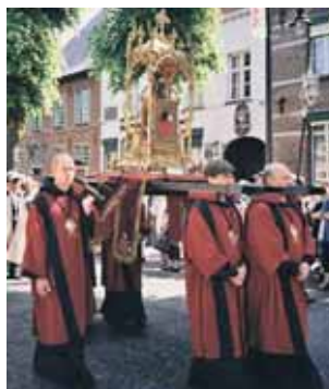
The relic being carried in procession