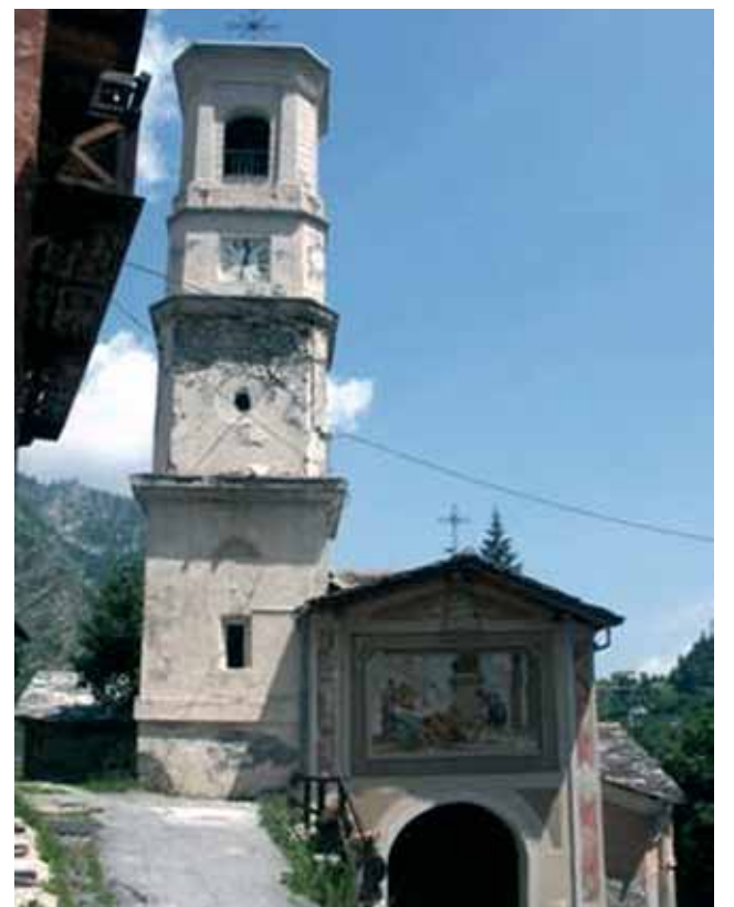
Parish Church of Canosio