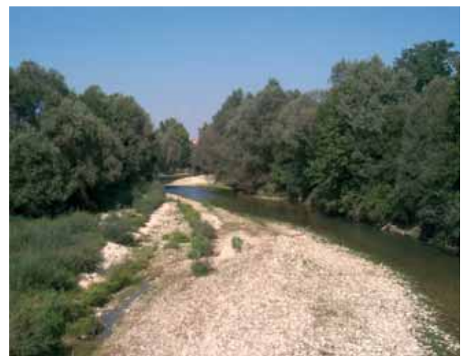
The Maira River

Canosio is a small village in the region of Val Maira, in the Diocese of Saluzzo. In 1630, its townspeople had grown cold in their religious observance due to the spread of the Calvinistic heresy. A day after the feast of Corpus Christi, the river at Maira flooded because of a torrential rainfall. The flood waters were so violent and powerful that some massive stones were dislodged from the mountain and threatened to destroy the valley and the village itself!