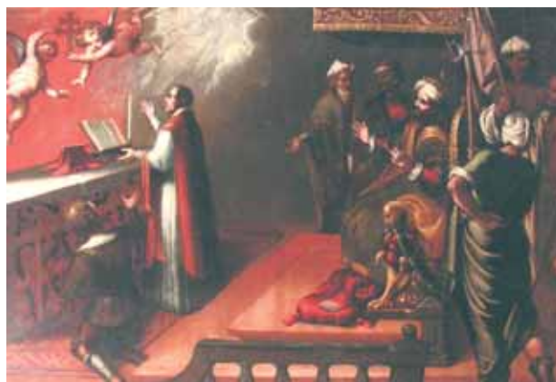
Ancient painting in the interior of the Church depicting the Miracle