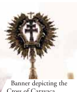
Banner depicting the Cross of Caravaca