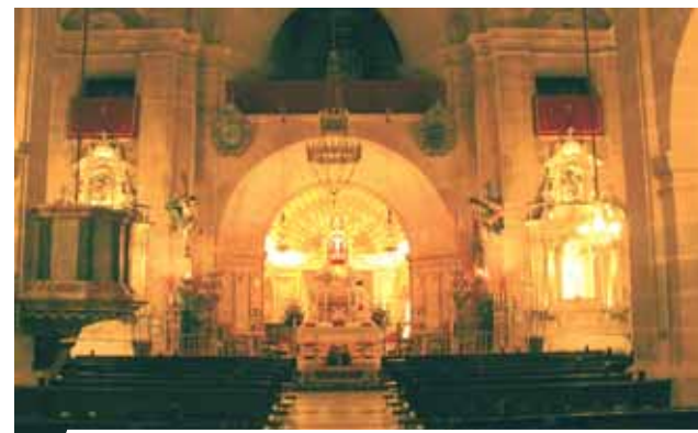
Interior of the Church of Santa Cruz