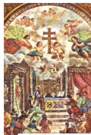
Fresco of the church