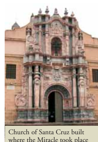
Church of Santa Cruz built where the Miracle took place