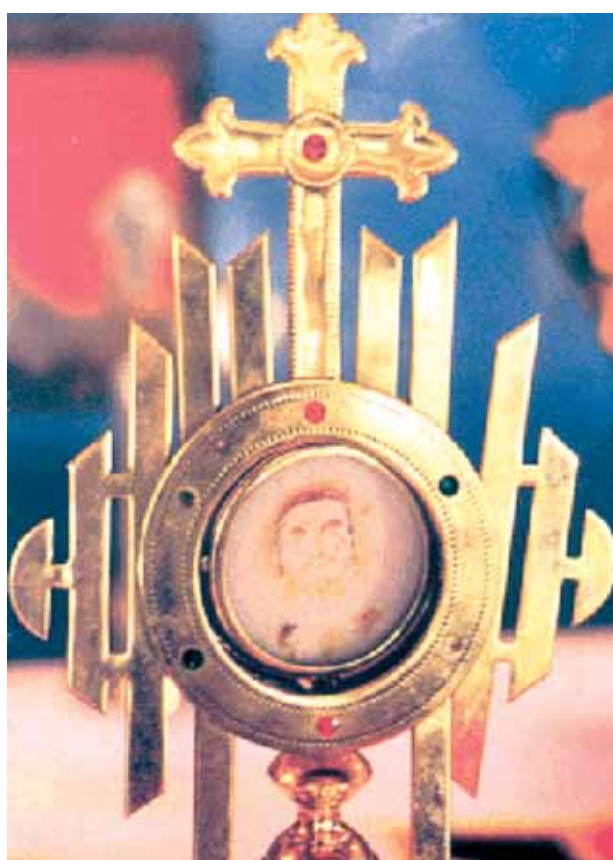
Monstrance containing the Particle in which the image appeared