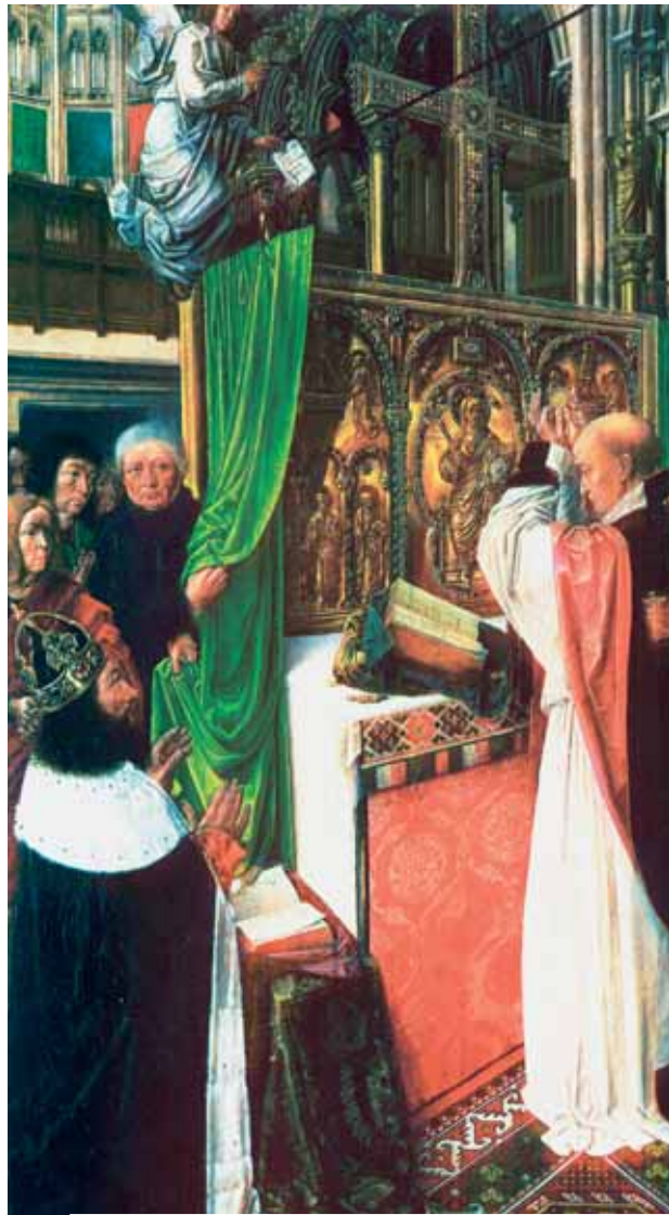
The Mass of St. Egidio in the presence of Charles Martel, National Gallery of London