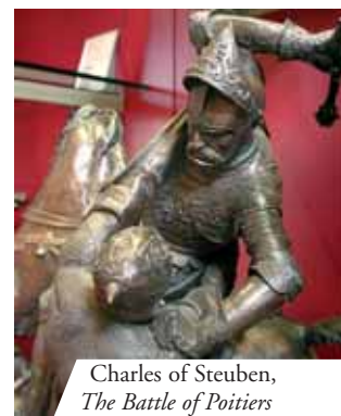
Charles of Steuben, The Battle of Poitiers