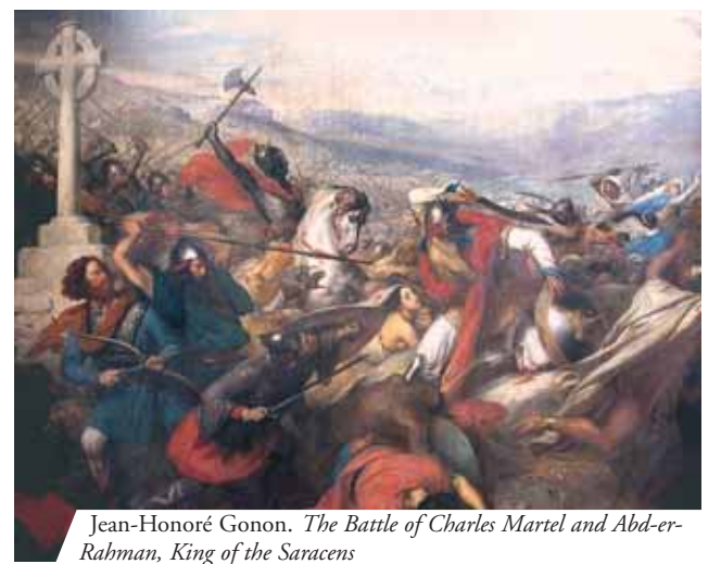
Jean-Honoré Gonon. The Battle of Charles Martel and Abd-er-Rahman, King of the Saracens

Prior to the victory celebration over the Saracens at Poitiers, Charles Martel had committed the grave sin of incest with his sister. Stricken by remorse, he did not dare confess the sin, so vile was the committed act. He decided therefore to go to Provenza and present himself to a well-known abbot of the time named Egidio, in order to seek absolution for this sin, without actually confessing it and while keeping the crime committed a secret. Saint Egidio was officiating at a Mass, when an angel appeared and placed himself near the altar, carrying in his hand a book in which was written the unconfessed fault. As the celebration continued, the writing in the book faded little by little until it completely disappeared, and Charles Martel felt himself absolved. The story of this sin and miraculous absolution was so