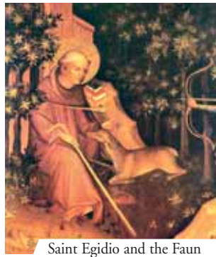
Saint Egidio and the Faun

Charles Martel had committed a grave sin, and stricken by remorse, decided to go to Provenza and present himself to a well-known abbot of the time named Egidio, in order to seek absolution for this sin, without actually confessing it and while keeping the crime committed a secret. Saint Egidio was officiating at a Mass, when an angel appeared and placed himself near the altar, carrying in his hand a book in which was written the unconfessed fault. As the celebration continued, the writing in the book faded little by little until it completely disappeared, and Charles Martel felt himself absolved.