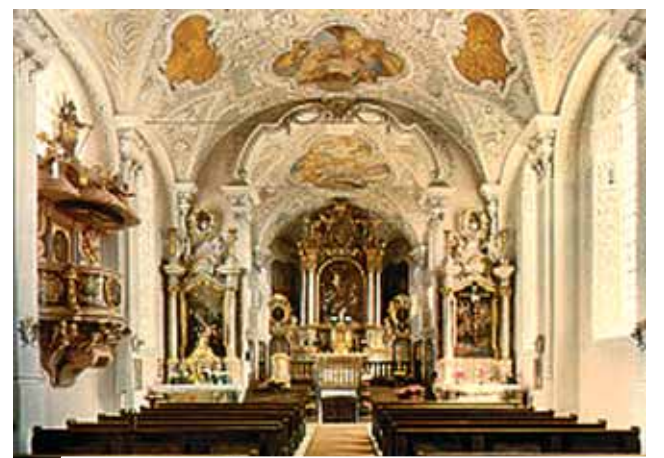
Interior of the Sanctuary