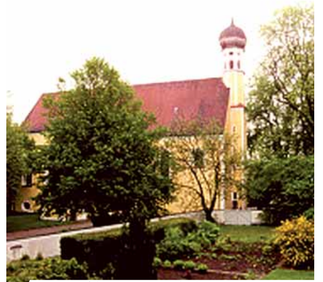
Sanctuary of the Most Precious Blood

A poor peasant of Erding could find no way to improve his economic state, despite working many hours every day. His neighbor on the other hand, who did the same work, succeeded in living prosperously. One day the peasant asked his neighbor how he had succeeded in earning so much and the man confided to him that his success was owed to the fact that he kept the Blessed Sacrament in his house. The poor peasant, ignorant in the faith thought that the Blessed Sacrament was a type of amulet, and decided to imitate his neighbor. He went to Mass on Holy Thursday and after having received Communion, hid the Host in his clothes and left the church with It. During his journey, however, his conscience began to accuse him, so he decided to bring the particle back. During the trip, however, the Host slipped from his hand and