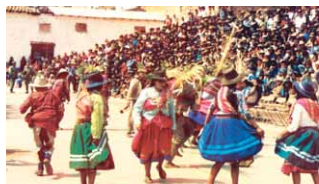
Celebrations in honor of the Divine Child