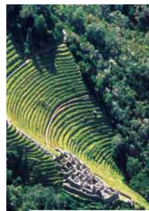
Ancient terraces, Peru