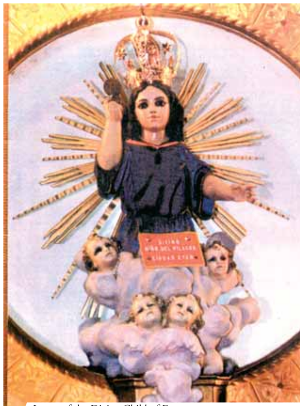
Image of the Divine Child of Eten

The Eucharistic Miracle of Eten happened about 365 years ago in the Peruvian town of Port Eten. In a Host exposed for public adoration, there appeared the Child Jesus and three interconnected hearts of a brilliant white color. Every year, the feast in honor of this event begins on July 12, with the transfer of the Host of the Miracle from its Sanctuary to the church in the City of Eten, and it ends on July 24.