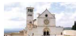
Upper Basilica of Saint Francis, Assisi