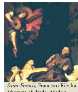
Saint Francis, Francisco Ribalta Museum of Prado, Madrid