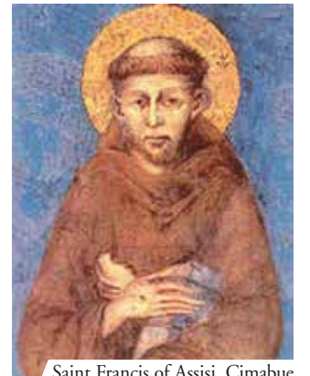
Saint Francis of Assisi, Cimabue