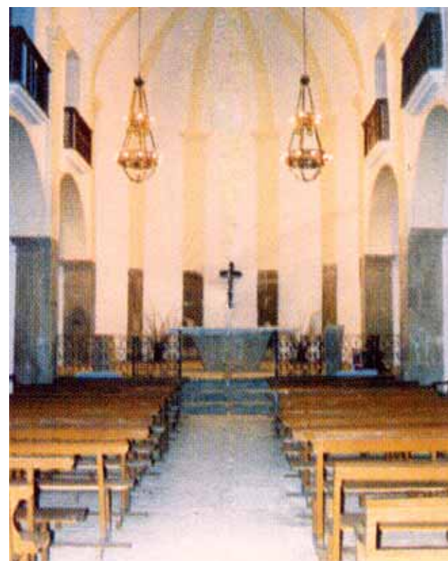
Inside the sanctuary