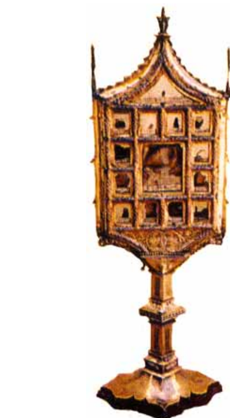
Monstrance containing the relics of the miracle