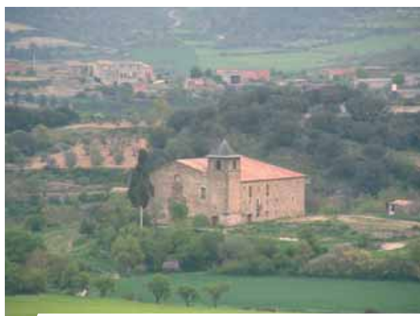
Sanctuary where the miracle occurred