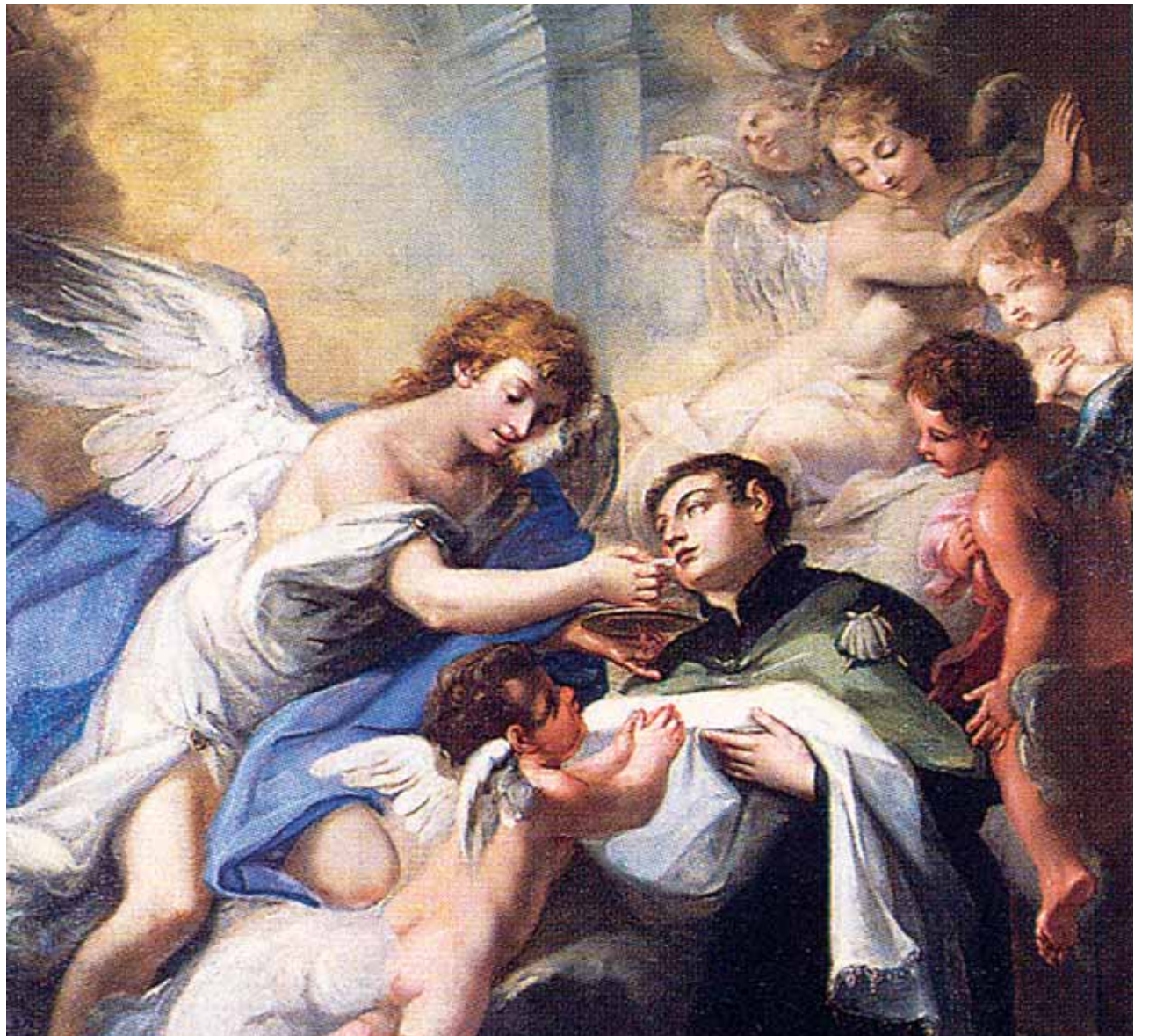
Saint Stanislaus receives Holy Communion from an Angel. Diocesan Museum of Milan

Saint Stanislaus Kostka, at the age of seventeen, was gravely ill, so much so that he seemed very much near the end of his life. In that time, he lived as the guest of a noble Protestant who would not even permit him to be visited by a Catholic priest. Stanislaus was not discouraged and one night, in the presence of his tutor, he received Communion in a miraculous way. A few days later he recovered and decided to enter the Jesuit order.