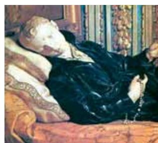
Tomb of Saint Stanislaus, St. Andrew's Church at the Quirinal, Rome