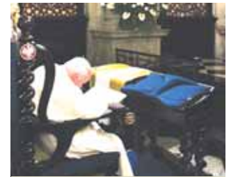
In the year 2000, Pope John Paul II decreed that on the first Sunday, after Easter, the Liturgical Feast of Divine Mercy is to be celebrated

Jesus to St. Faustina: "My daughter, help me to save a sinner in agony, recite the Rosary that I taught you for sinners". Sr. Faustina: "When I started to recite the Rosary, I saw a soul on his death bed suffering terrible torture and pain in fighting the last battle of life. The soul was being defended by his guardian angel, who was, however, helpless... A great multitude of demons were waiting for the soul, but while I was reciting the Rosary chaplet, I saw Jesus in the same aspect as depicted in the painting. The bright rays coming out of the Heart of Jesus surrounded the sick soul and the forces of evil ran away... The sick soul died serenely. When I regained my consciousness, I realized that the divine chaplet Rosary was an important prayer to be recited around the dying. This placates God's wrath. (St. Faustina Kowalska, Diary, Vatican Library Edition, p. 515)