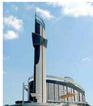
Shrine of the Divine Mercy, Cracow