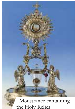
Monstrance containing the Holy Relics

An inscription in marble from the 17th century describes this Eucharistic miracle which occurred at Lanciano in 750 at the Church of St. Francis. “A monastic priest doubted whether the Body of Our Lord was truly present in the consecrated Host. He celebrated Mass and when he said the words of consecration, he saw the Host turn into Flesh and the Wine turn into Blood. Everything was visible to those in attendance. The Flesh is still intact and the Blood is divided into five unequal parts which together have the exact same weight as each one does separately.