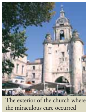
The exterior of the church where the miraculous cure occurred