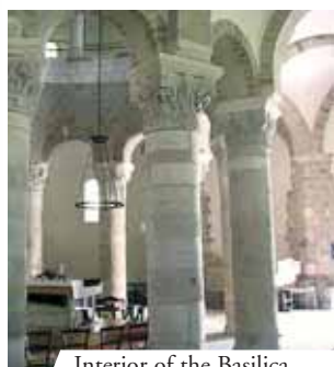
Interior of the Basilica