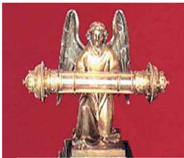
Reliquary of the Precious Blood

There are two drops of blood from our Lord, Jesus Christ, collected on Calvary during the Passion preserved in the church of Neuvy-Saint-Sépulcre in Indre. They were brought to France in 1257 by Cardinal Eudes returning from the Holy Land.