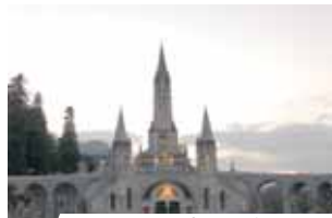
Sanctuary of Lourdes

In 1888, a French priest of the National Pilgrimage proposed the creation of a procession with the Blessed Sacrament in Lourdes, then a miraculous healing was realized. Since then the sick make pilgrimages to Lourdes, are blessed by the Holy Sacrament and countless have been cured of illnesses during the procession of the Blessed Sacrament. The Sanctuary of Lourdes is a clear example of the Real Presence of Jesus in the Eucharist.