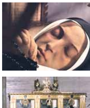
The incorruptible body of Saint Bernadette in the mother house of the Sisters of Charity in Nevers