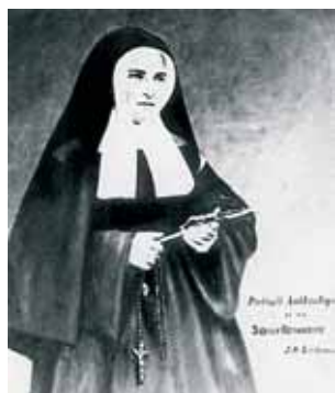
Saint Bernadette decided to embrace religious life and entered into the convent of the Sisters of Charity in Nevers