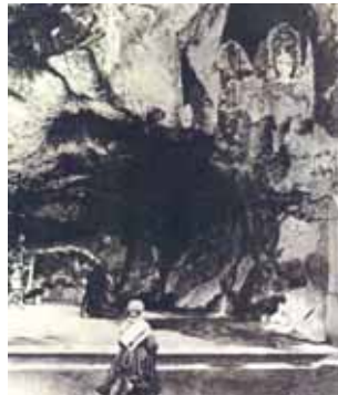
One of the oldest photos of Bernadette by the grotto in 1864