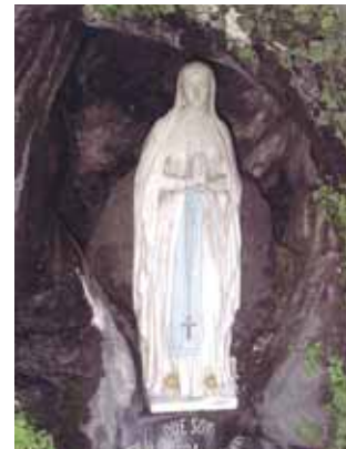
Statue of Our Lady in the grotto where she appeared to Bernadette