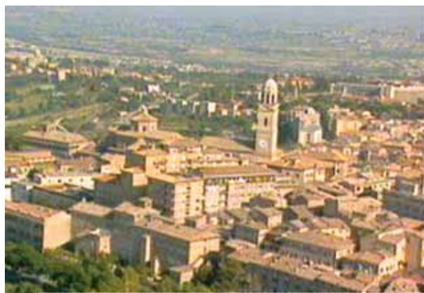
View of Macerata