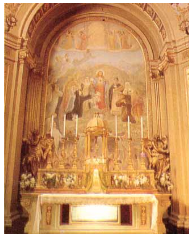
Chapel of the Most Blessed Sacrament where the relic is kept

In 1493 one of the first confraternities in honor of the Most Blessed Sacrament was instituted at Macerata (1494) and it was here that the pious practice of Forty Hours was established in 1556. Every year, on the occasion of Corpus Christi, the corporal of the miracle is carried in procession behind the Most Blessed Sacrament.