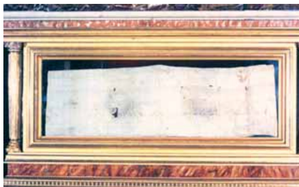
Relic of the Blood-Stained Corporal