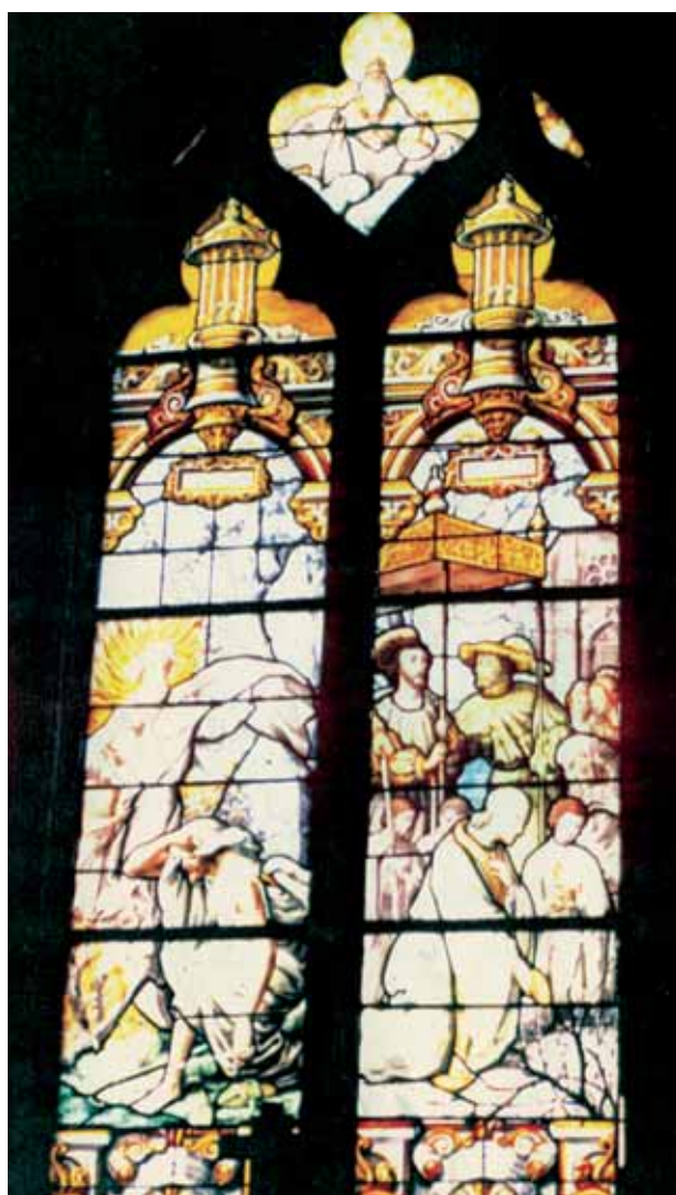
Window depicting the miracle

In 1533, some thieves stole a ciborium containing some consecrated Hosts from a church. The thieves then discarded the Hosts in a field. Unfortunately there was a strong snow storm; however, the following day the Hosts were recovered and miraculously were found to be in perfect condition. The numerous healings and the tremendous popular devotion that followed the miracle were not sufficient to protect the Hosts which were destroyed by some seeking to profane them.