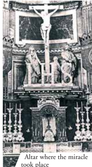
Altar where the miracle took place