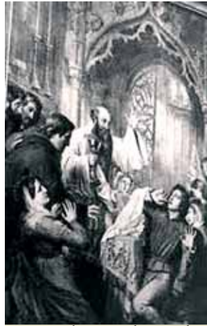
Painting depicting the miracle, Church of St. James, Louvain