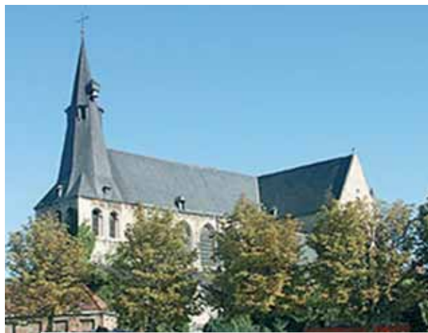
Church of St. James in Louvain