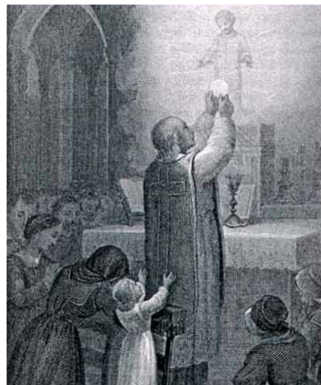
Ancient print of the miracle