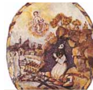
Inés in the cave where she lived as a hermit