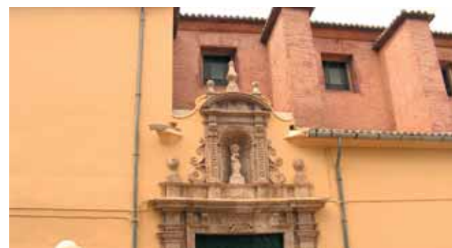
The church where the miracle took place