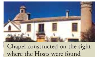
Chapel constructed on the sight where the Hosts were found