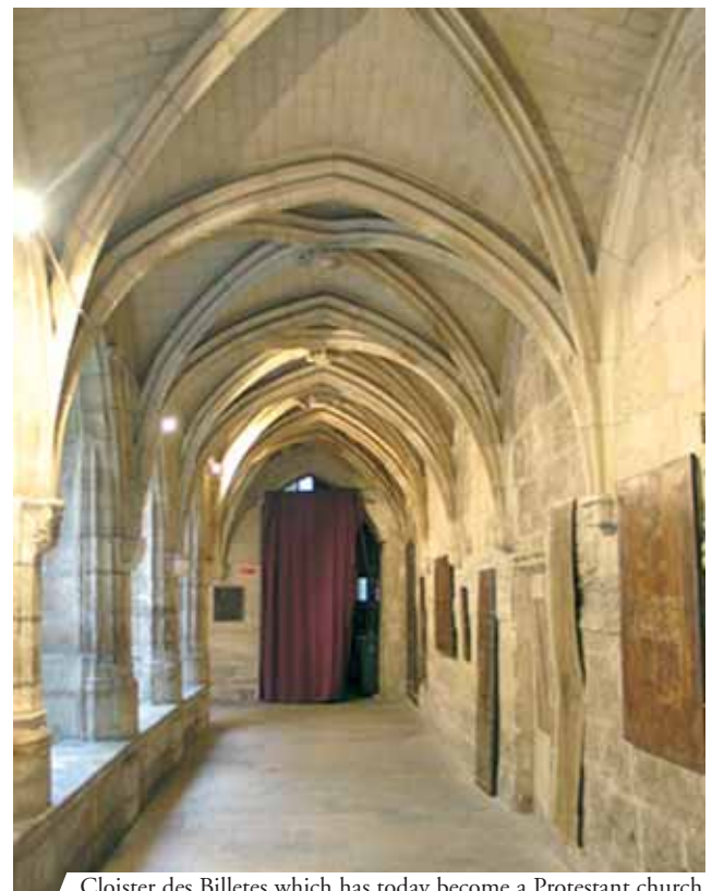
Cloister des Billetes which has today become a Protestant church