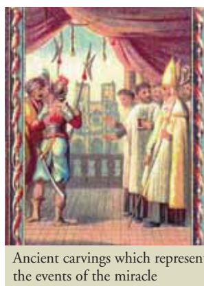
Ancient carvings which represent the events of the miracle