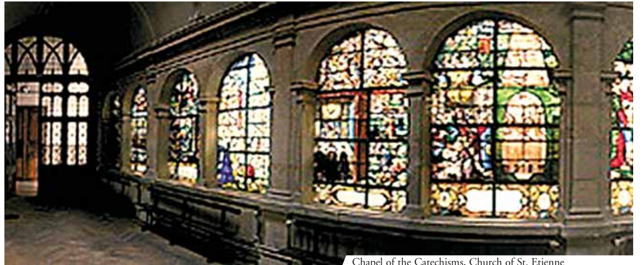
Chapel of the Catechisms, Church of St. Etienne

Desperate, he threw the Host into boiling water and the Host freed itself from the water hovering in mid-air and then taking the form of a crucifix.