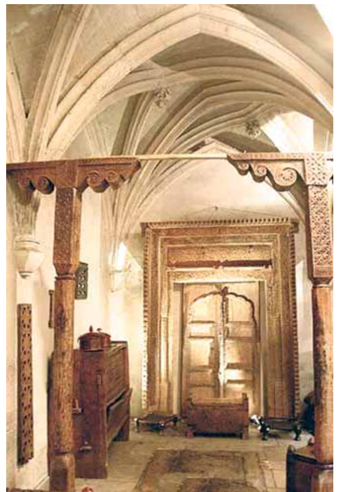
The interior of the cloister of the church des Billetes