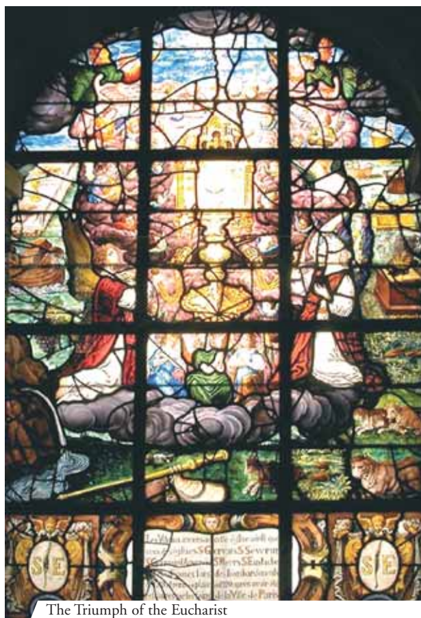
The Triumph of the Eucharist