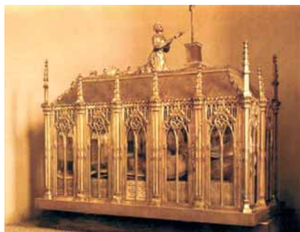
Tomb of St. Germaine