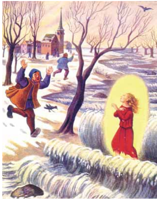
Antique painting in which the miracle is depicted

The Eucharistic Miracle of Pibrac is about Saint Germaine Cousin (1579-1601). In order for St. Germaine Cousin to participate in the Holy Celebration of the Mass, she had to cross through a violent stream with extreme high waters; the waters divided in two and let her pass undisturbed.