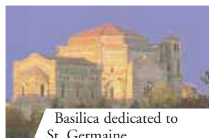
Basilica dedicated to St. Germaine