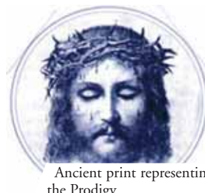
Ancient print representing the Prodigy