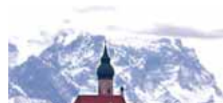
The church of the Benedictine monastery in Andechs

Among the most important works, in which this Eucharistic miracle that occurred in Rome in 595 is mentioned, is Vita Beati Gregorii Papae written by the Deacon Paul in 787. It was customary in those times to have the Eucharistic bread prepared by the parishioners. The Pope St. Gregory the Great was a direct eyewitness to this prodigy.