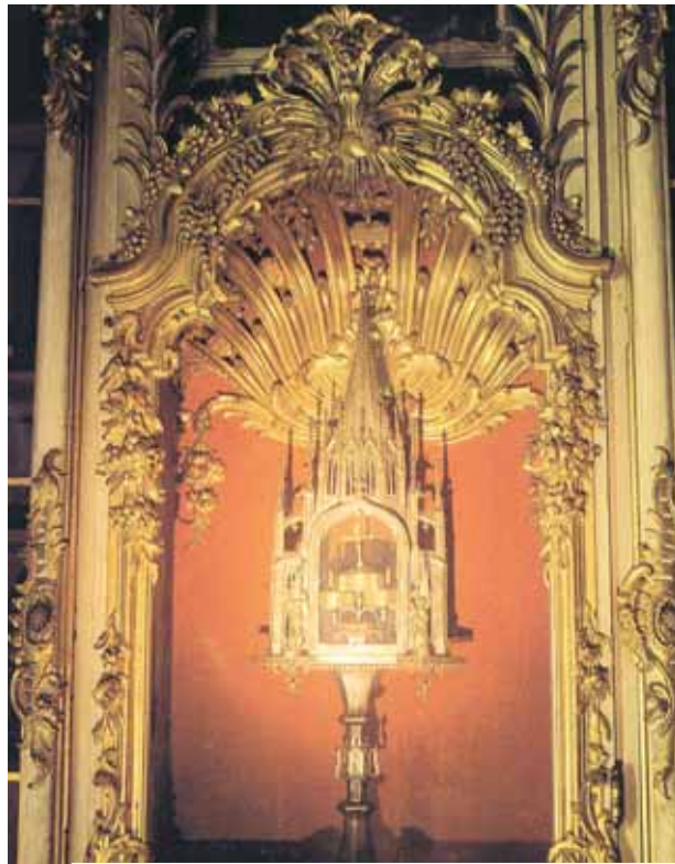
The shrine that contains the Host of the miracle which is preserved to this day in Andechs

This Eucharistic Miracle, whose relic is still preserved in the Benedictine Monastery of Andechs, Germany, is verified by numerous written sources. The authentication took place in Rome in 595 during a Eucharistic celebration presided by Pope St. Gregory the Great. At the moment of receiving Holy Communion, a Roman noblewoman began to laugh because she had doubts about the Real Presence of Christ in the consecrated Bread and Wine. The Pope, troubled by her disbelief, decided not to give her Communion and then the Bread turned into Flesh and Blood.