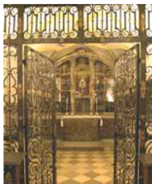
The chapel in Andechs that houses the shrine