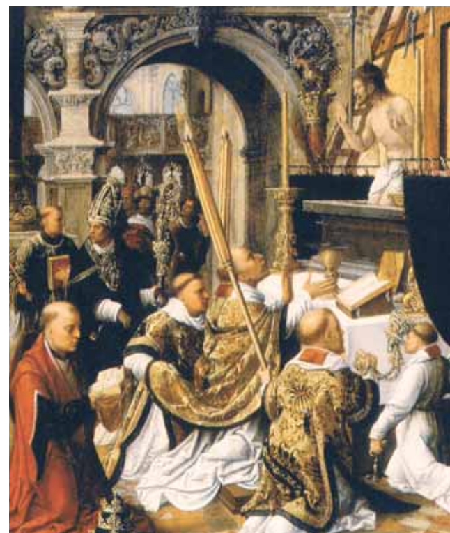
Adrien Ysenbrandt, 16th century. The apparition of Jesus with the signs of the Passion during the Mass of St. Gregory

she made with her very own hands could become the Body and Blood of Christ during the consecration. St. Gregory denied her Communion and asked God to illuminate her. Having just finished praying, he saw that part of the bread, prepared by the woman, become Flesh and Blood. The woman repented, knelt on the ground and began to cry. To this day, part of the relic of the miracle is housed in Andechs, Germany, near the local Benedictine monastery.