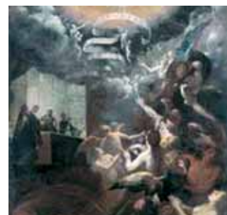
The miraculous Mass at which St. Gregory freed numerous souls from purgatory