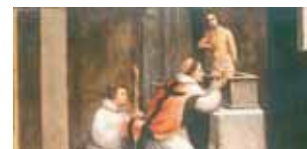
Mass of St. Gregory. Museum Hiéron, Paray-le-Monial