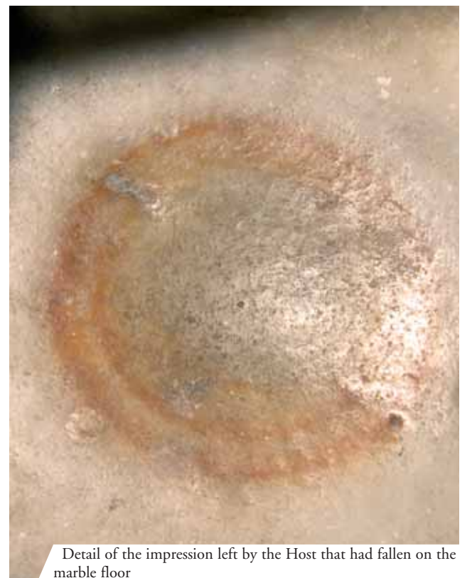
Detail of the impression left by the Host that had fallen on the marble floor

Chapel, constructed by the Caetani family, to this day there is the imprint and the stain of Blood left by a Host which fell from the hands of a priest while celebrating the Mass. The man was overtaken by doubts about the Real Presence of Jesus in consecrated Host, and immediately after the consecration, he inadvertently let the Host fall to the ground, where the imprinted mark is still visible today.