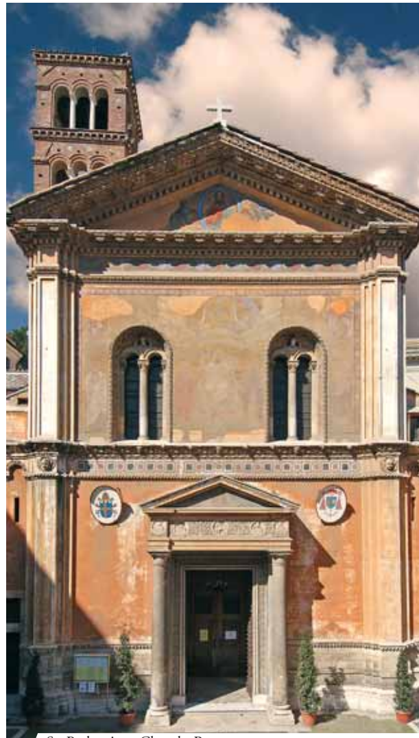
St. Pudenziana Church, Rome

It is still possible today to see the miraculous imprint left by the Host which fell on the steps of the altar in the Caetani Chapel of Santa Pudenziana Church in Rome. The imprint on the step was left when the Host fell from the hands of a priest, who, while celebrating Mass was taken with doubt on the Real Presence of Christ in the sacrament of the Eucharist.