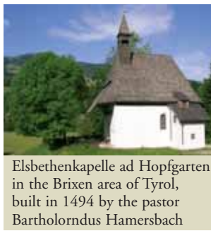
Elsbethenkapelle ad Hopfgarten in the Brixen area of Tyrol, built in 1494 by the pastor Bartholorndus Hamersbach