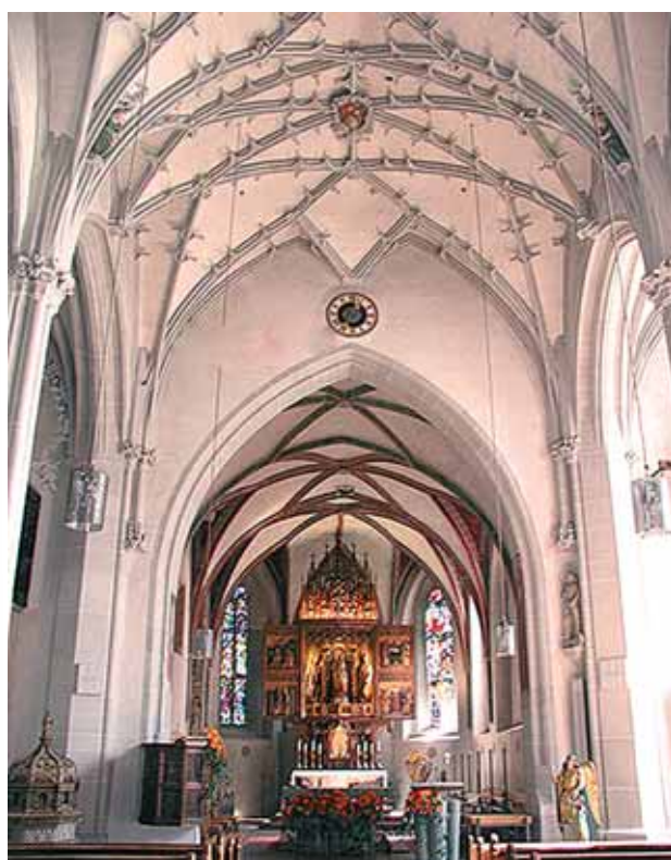
Main altar of the Church of St. Oswald, Seefeld