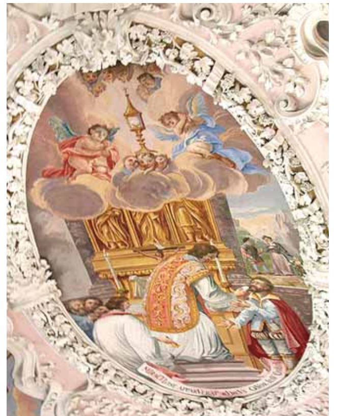
Miracle of Seefeld. Detail of the ceiling