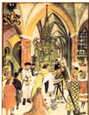
Ancient painting of the miracle