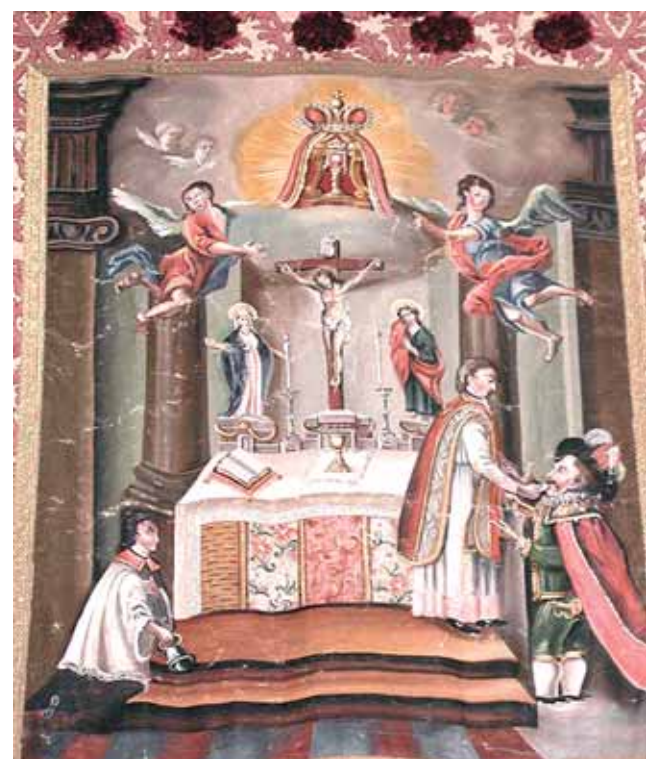
Banner in the Church of St. Oswald depicting the scene of the miracle