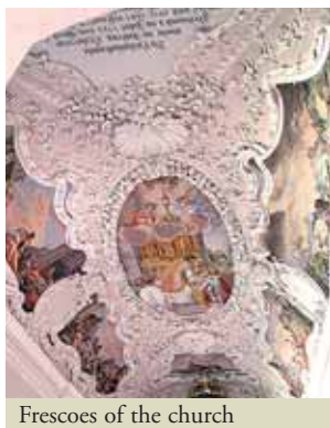
Frescoes of the church depicting the miracle