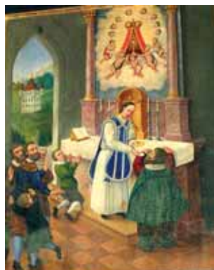
Painting of the Miracle of Seefeld, preserved in the Elsbethenkapelle ad Hopfgarten