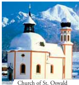
Church of St. Oswald