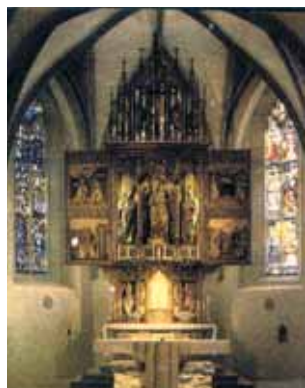
Altar of the miracle