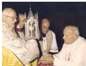
His Holiness John Paul II in 1980 in Siena in adoration before the Hosts of the miracle