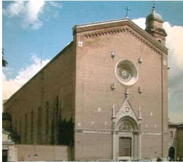
Basilica of St. Francis, Siena