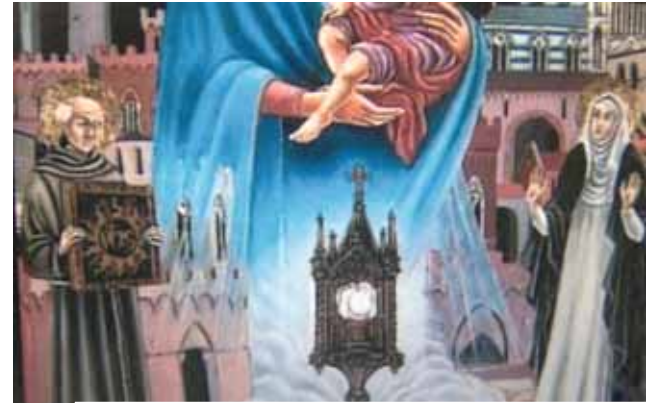
Detail of a painting depicting the Hosts of the miracle in Santa Maria in Provenzano