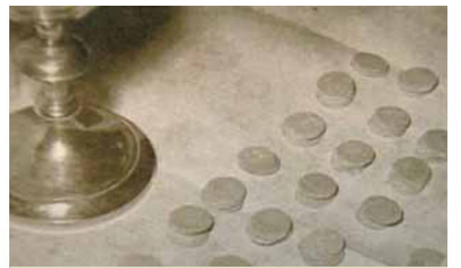
Fourteen tests were made to verify the condition of the Hosts. The most scientific one was the one wanted by St. Pius X in 1914, in the presence of many scientists