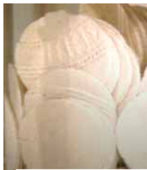
The Sacred Hosts of Siena