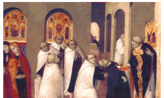
This painting of Master Stefano di Giovanni, known as “il Sassetta,” is preserved in England in the Bowes Museum in Barnard Castle. It depicts the scene of another Eucharistic miracle that took place near Siena in a Carmelite monastery. The painting depicts a Carmelite monk who, tormented by doubts regarding the Real Presence of Jesus in the Blessed Sacrament, is freed from the devil after receiving Communion