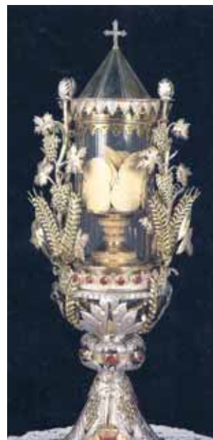
The sacred Hosts in the processional monstrance