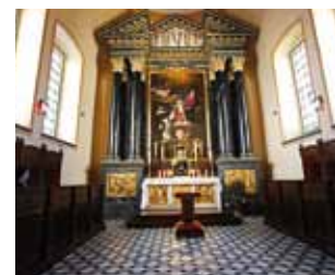
Interior Chapel where the precious Relic is kept