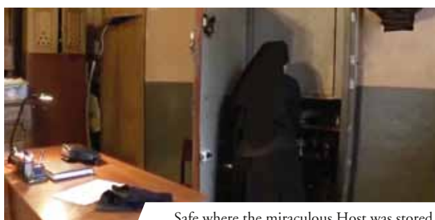
Safe where the miraculous Host was stored