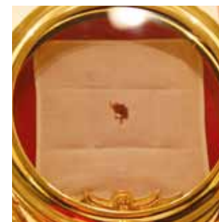
The fragment of the partially dissolved Host with the blood colored substance emanated from its interior is the relic that was placed on the white corporal with an embroidered red cross.