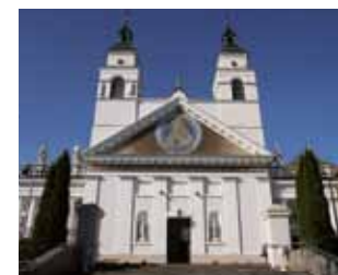
Church dedicated to Saint Anthony in Sokółka