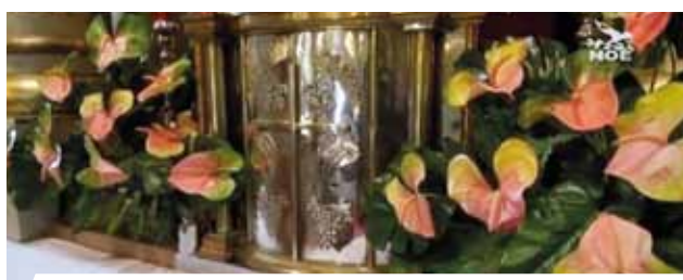
Tabernacle where miraculous Host that fell to the ground was first stored