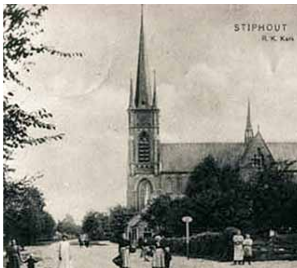
Saint Trudo's Church, Stiphout