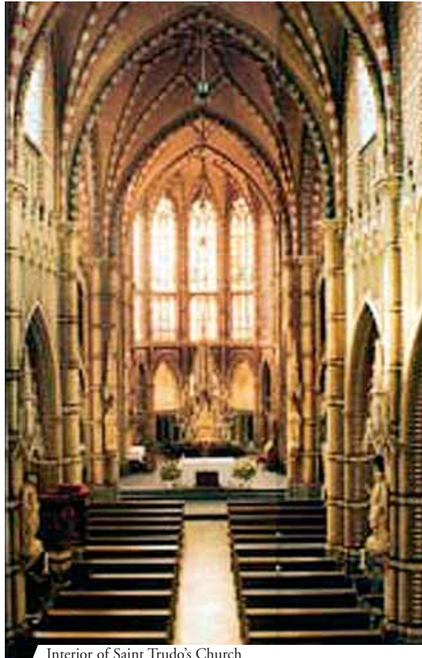
Interior of Saint Trudo's Church

This event is venerated each year by the residents of Stiphout especially on the feast of Corpus Christi.