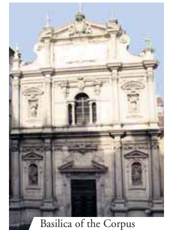
Basilica of the Corpus Domini, Turin