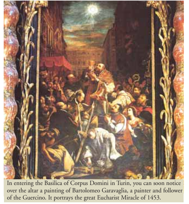
In entering the Basilica of Corpus Domini in Turin, you can soon notice over the altar a painting of Bartolomeo Garavaglia, a painter and follower of the Guercino. It portrays the great Eucharist Miracle of 1453.