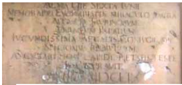
Commemorative plaque of the Miracle, Turin