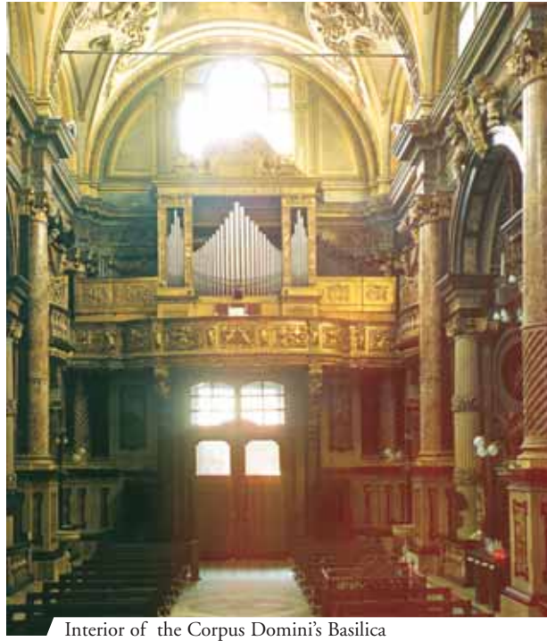
Interior of the Corpus Domini's Basilica

Inside the Corpus Domini Basilica in Turin, there is an iron railing that closes in the place where it came true the first Eucharistic miracle that happened in Turin in 1453. An inscription inside the railing describes the miracle: “Here the she-mule, that was carrying the Divine Body, fell prostrate - here the Sacred Host, having freed Itself from the bag that was imprisoning It, rose by Itself high - here clement came down among the suppliant hands of the Torinese - here then the place made holy by the miracle - remembering it, praying on your knees let it move you to venerate or to be in fear (June 6, 1453)”.