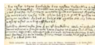
Text of the notation written by John Ribera in which he certifies that "till now the Holy Chalice is preserved in our Cathedral"