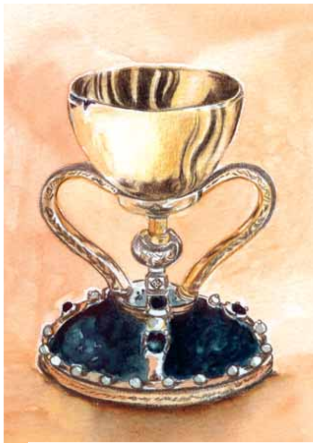
The Holy Chalice of Valencia

This precious object has always been at the center of fantastic stories and novels like the legend of the Knights of the Round Table in England, the stories of Perceval in France and Parzival in Germany of the Twelfth - Thirteenth century. This genre was used by Wagner in a Christian-esoteric perspective and at the end of the twentieth century the fantastic novels of B. Cornwell favored the birth of the editorial trend still alive today.