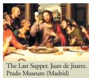
The Last Supper. Juan de Juevez. Prado Museum (Madrid)