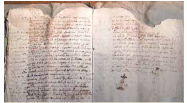
The document which records the sworn and written testimony of those witnesses who were present at the apparition