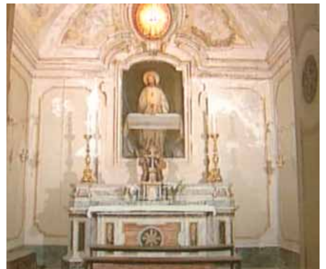
The chapel where the apparition occurred

At Easter in 1570, in the Church of St. Erasmus, the consecrated Host, according to the traditional rite at the time, was placed in a round silver container (pyx) and placed in a burse like holder – this was later placed in a large ceremonial silver chalice with its paten; the whole wrapped in an elegant silk cloth.