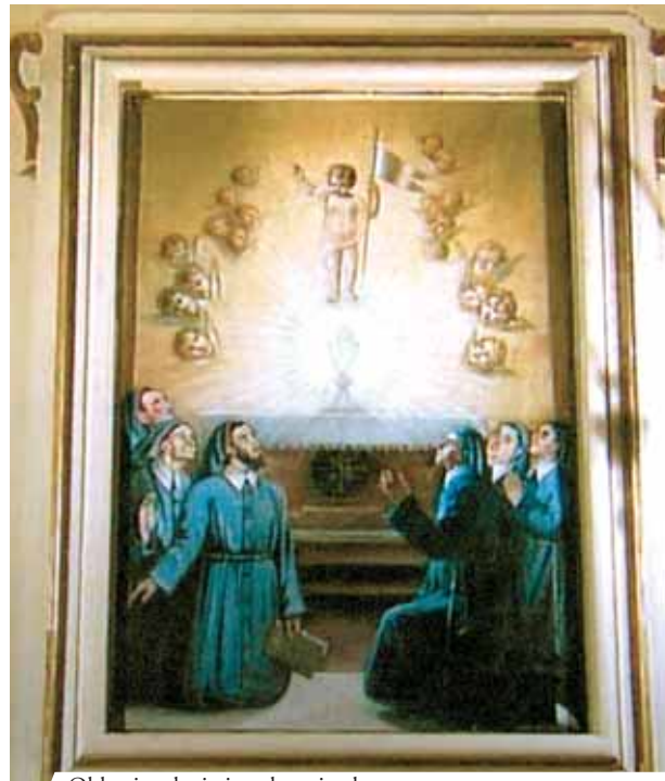
Old print depicting the miracle

During Easter of 1570, in the Church of St. Erasmus in Veroli, the Blessed Sacrament was exposed (at the time, the Blessed Sacrament was first placed in a round pyx and then placed in a large chalice, covered with a paten) for the 40 hours of public adoration. The child Jesus appeared in the exposed Host and manifested many graces. Today, the chalice where the Blessed Sacrament was exposed is kept in the same church of St. Erasmus and is used once a year at the celebration of Mass on Easter Tuesday.