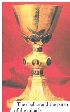
The chalice and the paten of the miracle