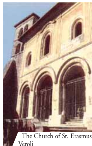
The Church of St. Erasmus, Veroli