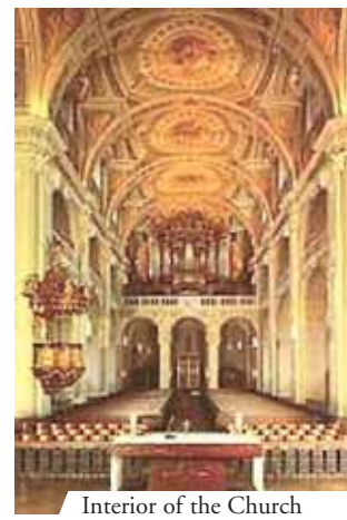
Interior of the Church