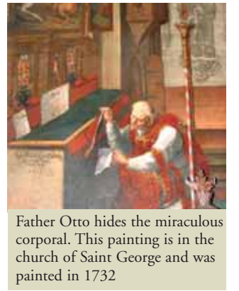
Father Otto hides the miraculous corporal. This painting is in the church of Saint George and was painted in 1732