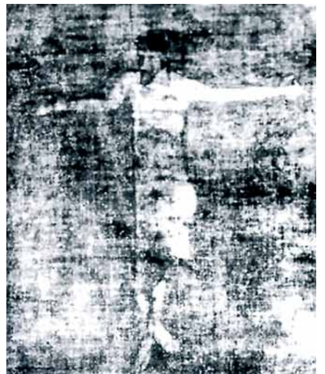
The Crucified Christ is clearly distinguished under ultra violet lighting