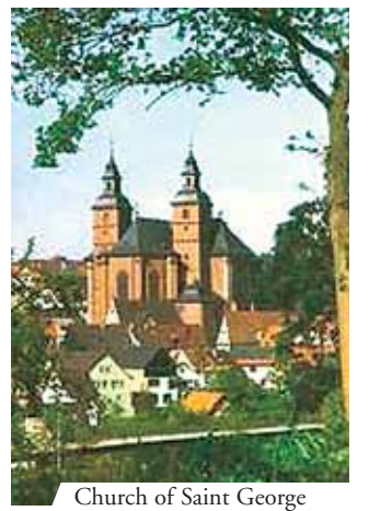
Church of Saint George