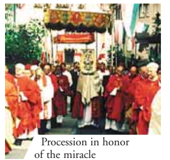
Procession in honor of the miracle