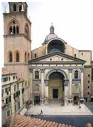
The relic of the Most Precious Blood of Jesus is preserved in the Basilica of Sant'Andrea in Mantua