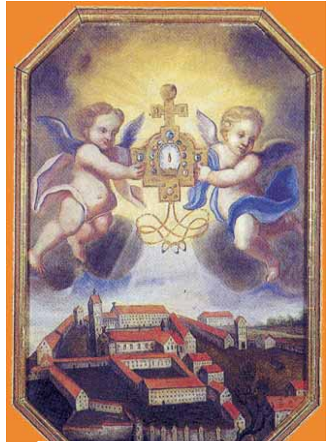
The relic of Precious Blood (17 th century). City Hall at Weingarten