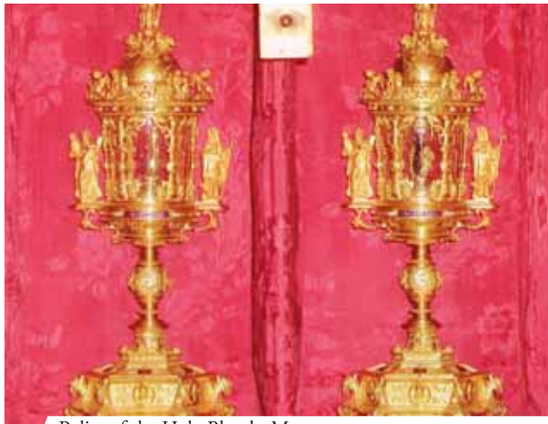
Relics of the Holy Blood, Mantua