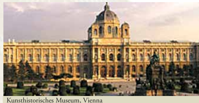
Kunsthistorisches Museum, Vienna