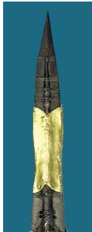
Relic of the Sacred Lance with which the Roman soldier struck the side of Jesus. Kunsthistorisches Museum, Vienna