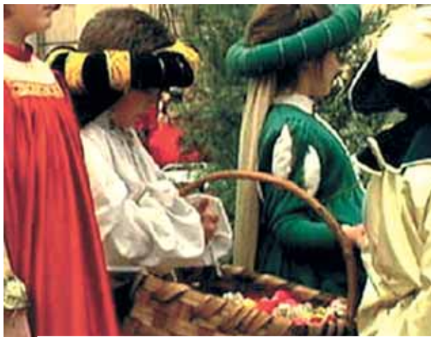
Procession in honor of the Holy Blood at Mantua