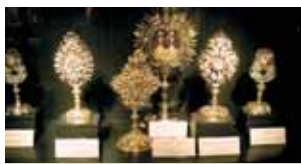
Monstrances containing some relics of the Passion of Christ, Kunsthistorisches Museum, Vienna