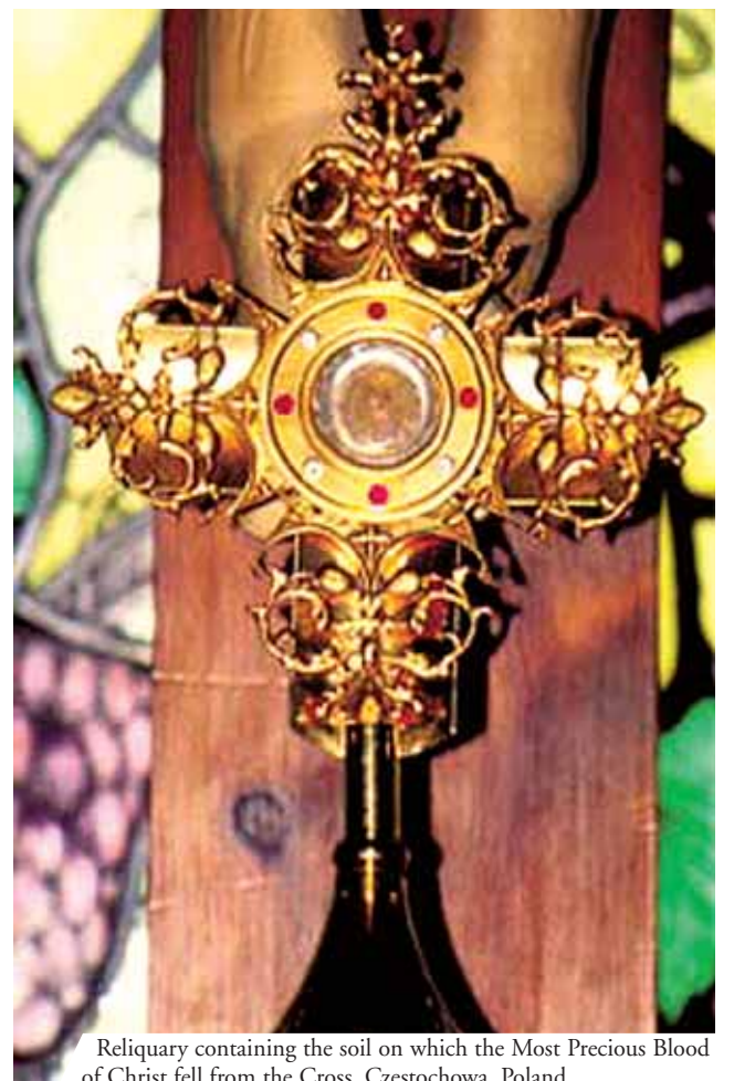
Reliquary containing the soil on which the Most Precious Blood of Christ fell from the Cross, Czestochowa, Poland