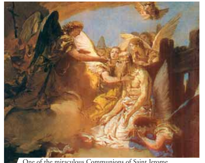
One of the miraculous Communion of Saint Jerome