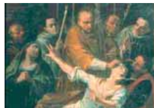
Saint Bernard exorcising a woman with the Blessed Sacrament, The Hieron Museum